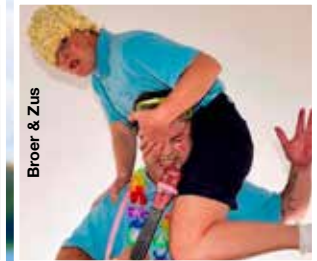
Broer & Zus