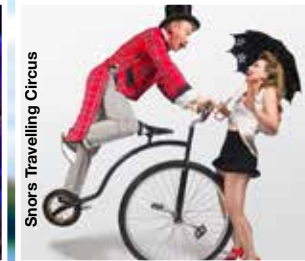
Snor's Travelling Circus